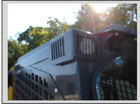
Front Work Light Guards