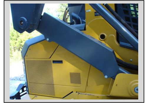
Boom Arm Linkage Hose Guard

The following kits are available through any John Deere Construction and Forestry Dealer. Please see your local dealer or visit our website for additional product information, pricing & pictures at www.grtractors.com