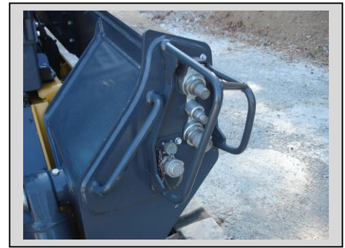
Aux Hyd Line Quick Coupler Guard