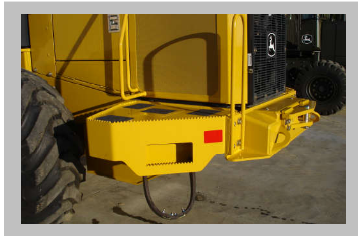
Rear Tire Deflectors

G.R. Manufacturing, Inc. is committed to providing operator and equipment protection as well as attachments and conversions for John Deere equipment used in various applications. We welcome any suggestions for new products and feedback on existing products.