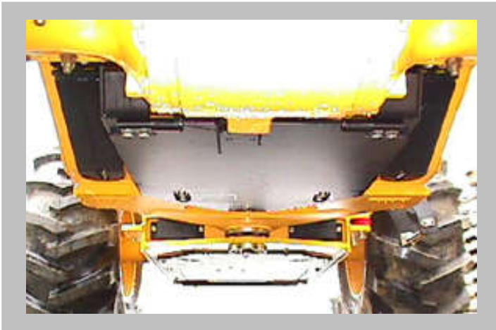
Extreme Service Hydraulic Bottom Guard