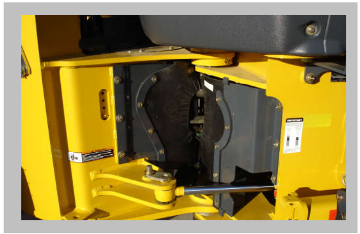
Articulation Area Guards