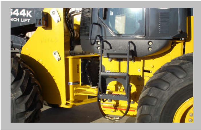
Trash Resistant Entry Step